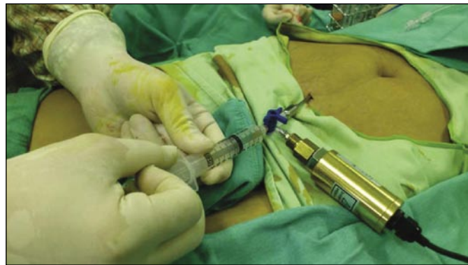
The negative pressure while pulling back of the plunger of a 10 cc syringe was shown during liposuction procedure.

pressure meter. While pulling back the plunger at different volume levels, the negative pressures were produced and recorded (Fig. 1). With a 10 cc syringe, we checked the negative pressure for every 1 cc of 10 cc; however in the 60 cc syringe, negative pressure for every 10 cc out of 60 cc was monitored. Then using the MAFT Gun®, the injection, the pressure of 3 different sizes of needles with variable injecting volume per triggering (volume of